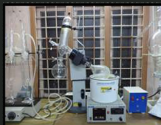
ROTARY VACUUM FLASH EVAPORATOR