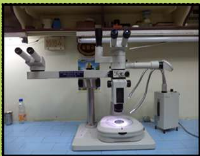
TRINOCULAR STEREOSCOPIC ZOOM MICROSCOPE