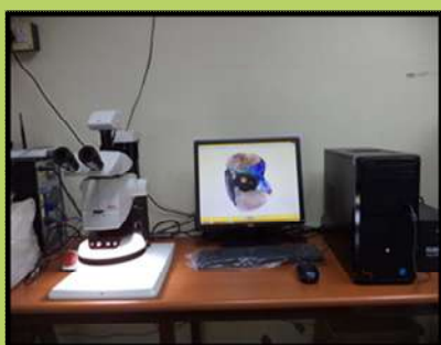
LEICA Stereo zoom microscope