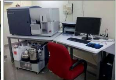
Instruments at CIS Laboratory