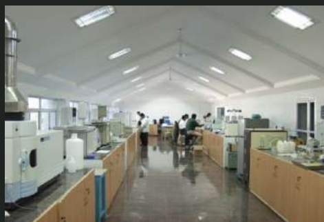
Instruments Lab - Marine sciences